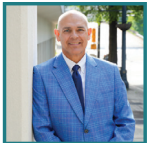
Bruce Thompson Commissioner of Labor